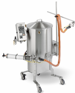
Panning Sprayer with 200 lb heated tank