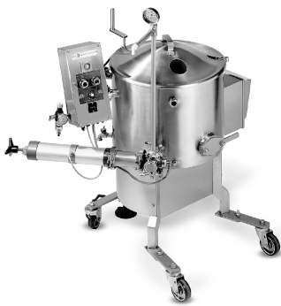
1 Nozzle Mould Depositor mounted to a 125 lb heated tank