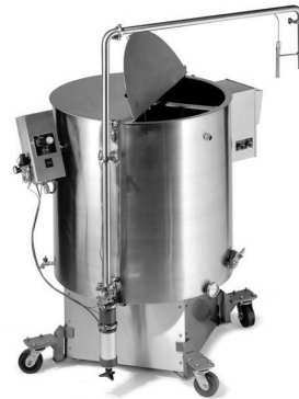
Automatic Transfer System with Level Sensor